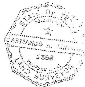
Exhibit "A" Attachment "II"